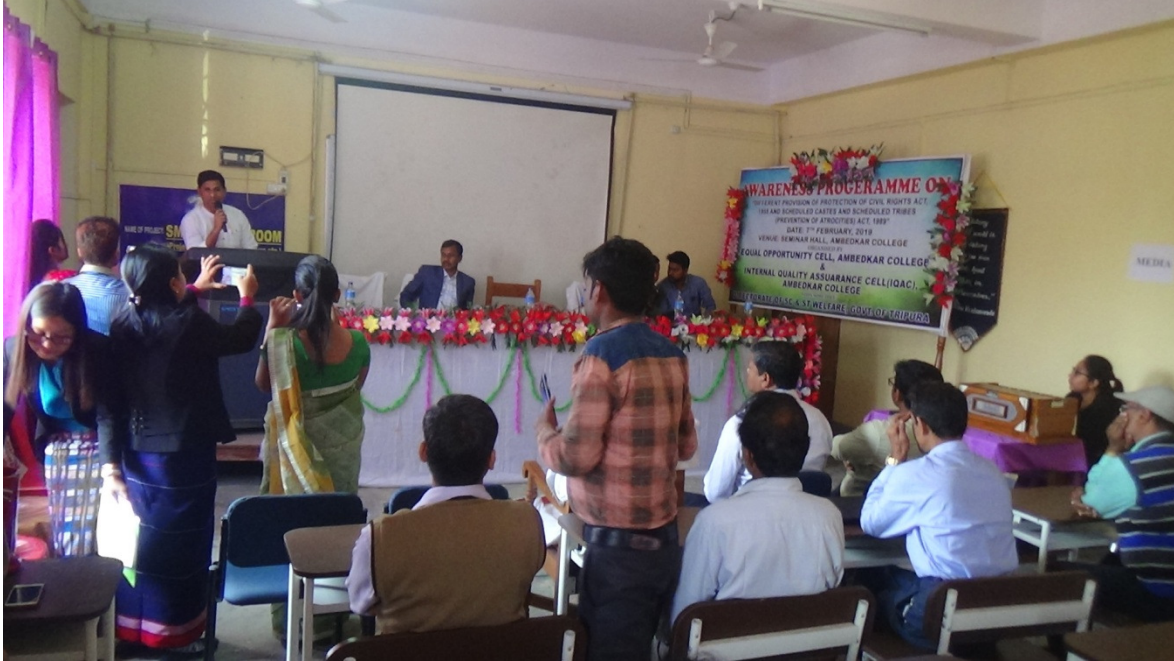
Speech by M. L. A., Fatikroy