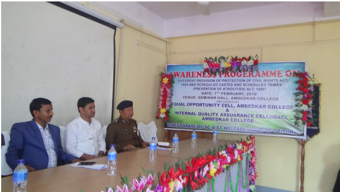
Distinguished Guests in the Inaugural Function