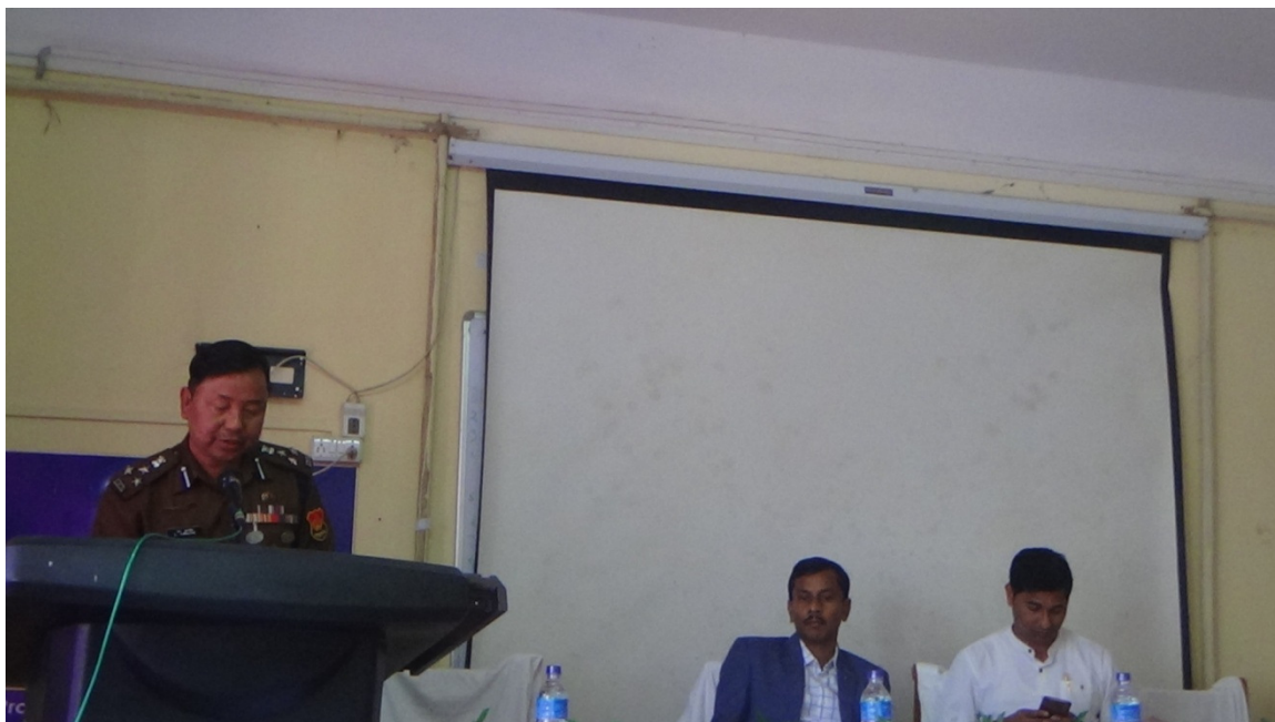
Speech by Chief Guest & Resource person