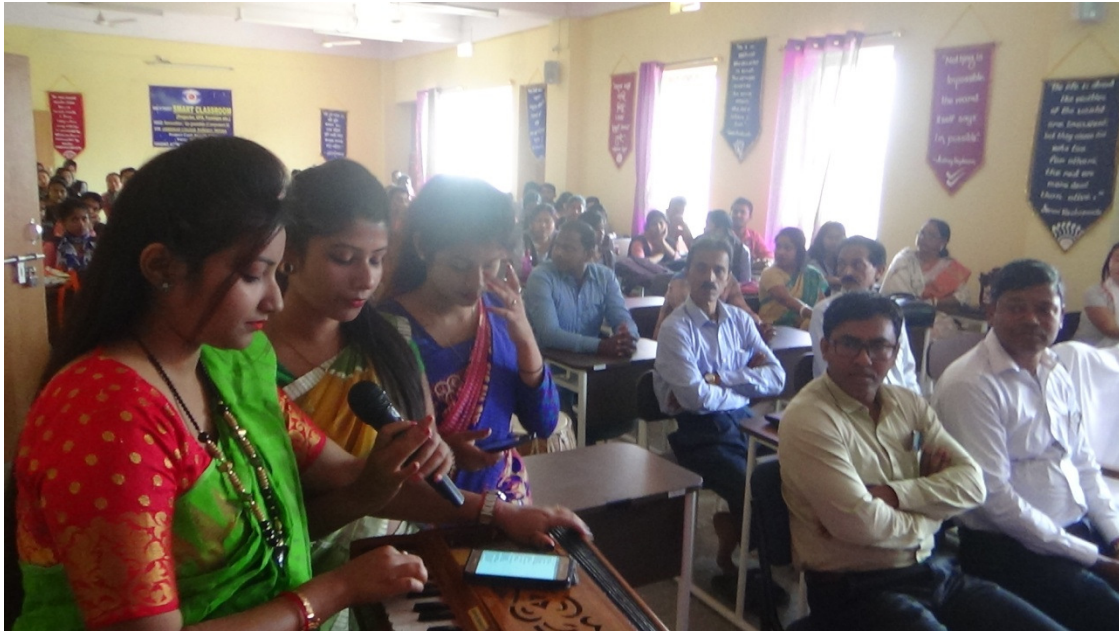
Inaugural Song by Students