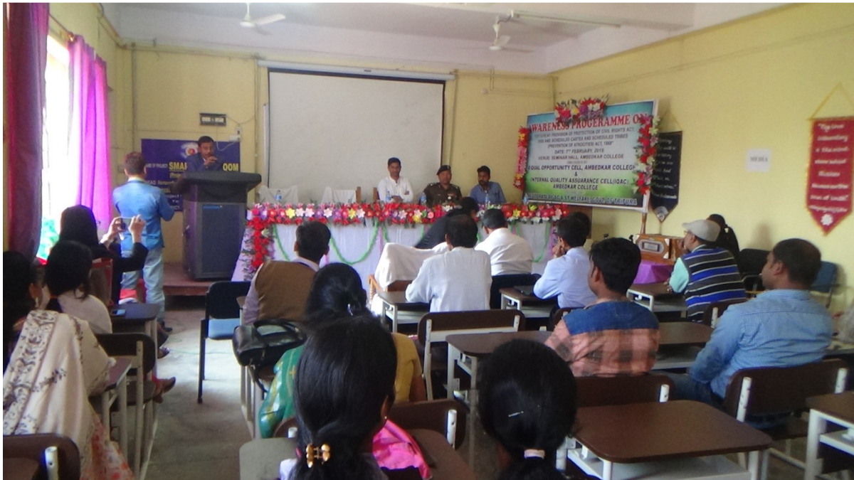
Speech by Principal i/c, Ambedkar College