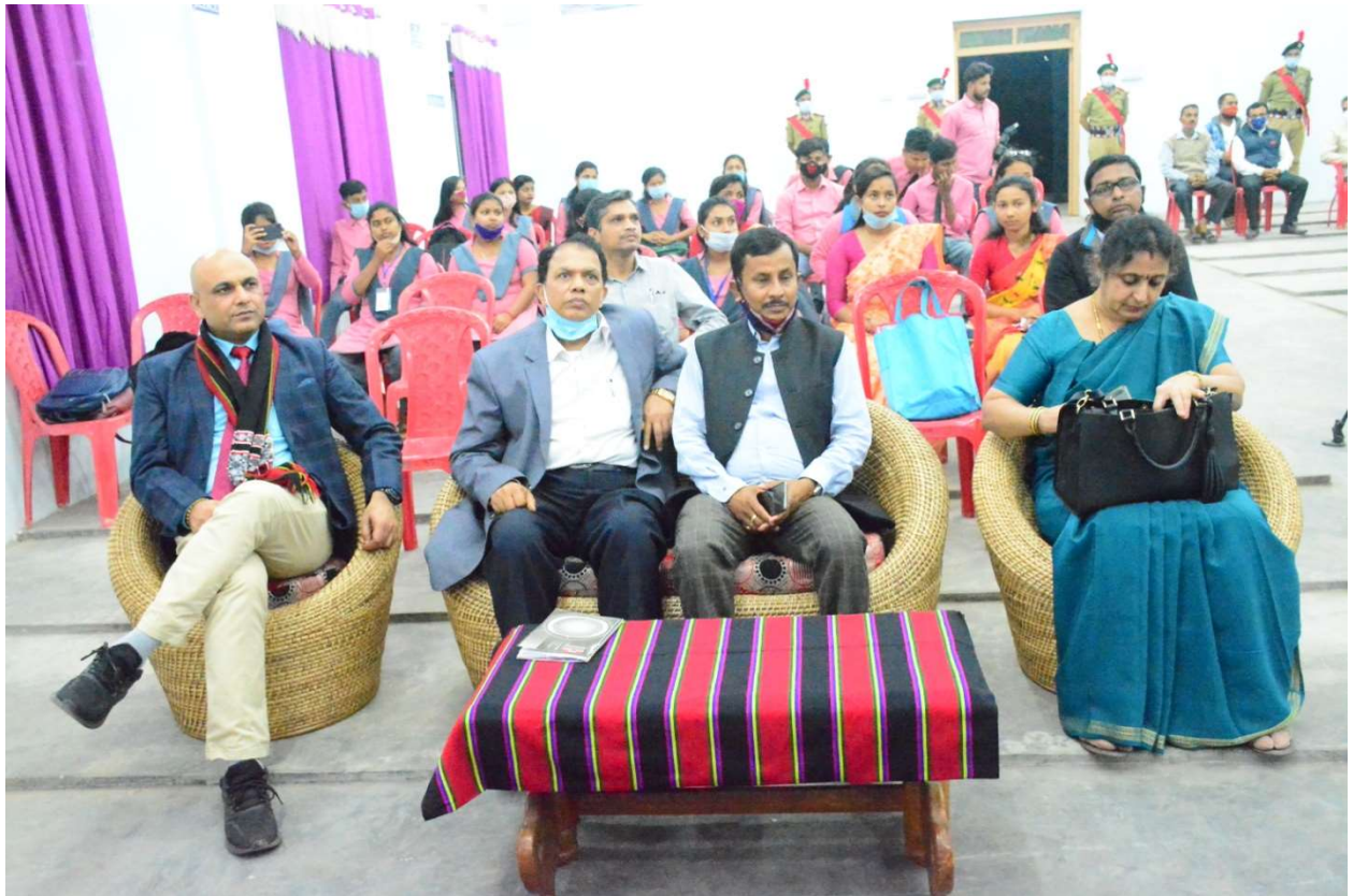
NAAC peer team members and Principal of the college watching the Cultural Programme on 26/02/2021