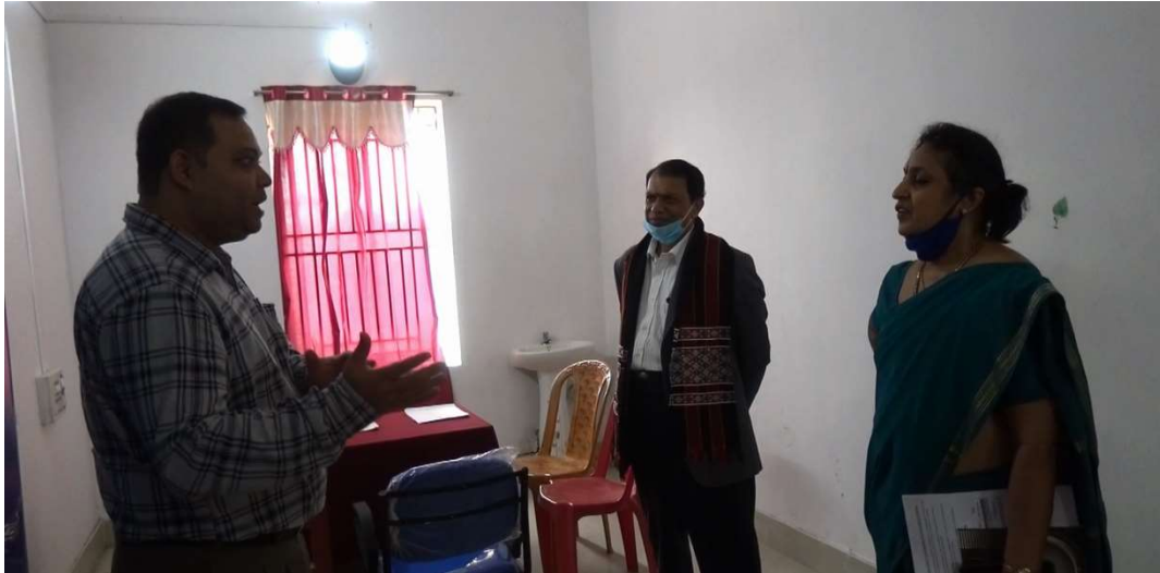
NAAC team interacting with faculty members inside the Dept. of Human Physiology on 26/02/2021