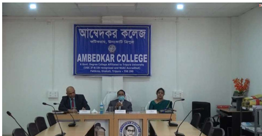
NAAC peer team during principal's presentation on 26/02/2021