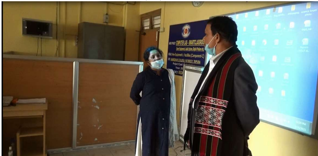
NAAC peer team chairman interacting with teacher inside Computer Lab on 26/02/2021