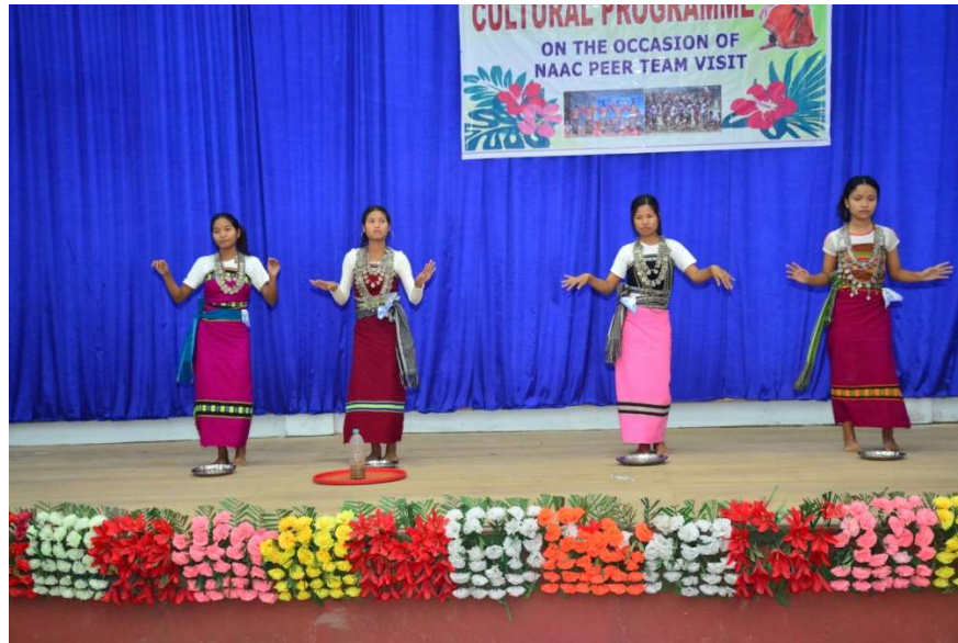
Students performing Hozagiri dance