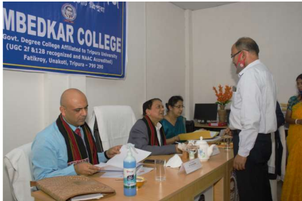
Interaction with Teachers' Council Secretary