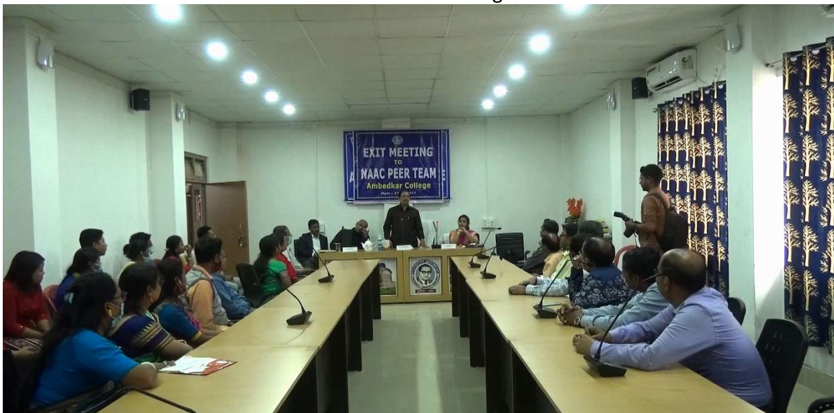
Teaching and non-teaching staff of the college present in the Exit Meeting on 27/02/2021