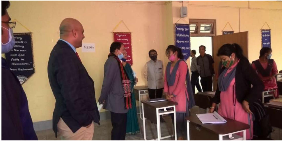
NAAC peer team interacting with students inside Smart Classroom-cum-Seminar Hall on 26/02/2021