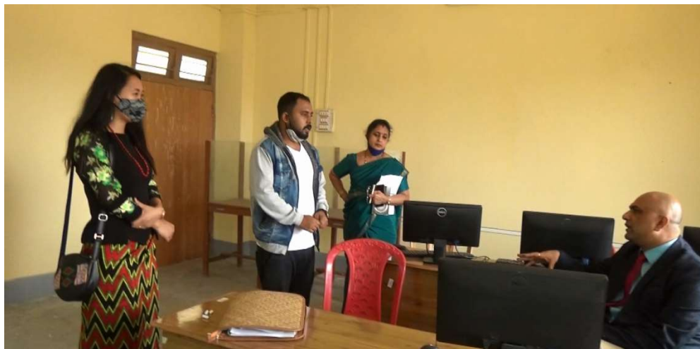
NAAC team interacting with faculty members inside the Language Lab on 26/02/2021