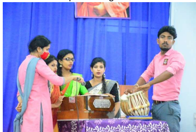
Students singing song in the cultural programm