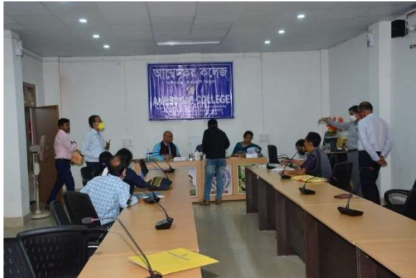
Interaction with Coordinator, Equal Opportuanatiy