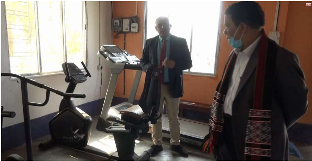
NAAC peer team members visiting College Gymnasium on 26/02/2021