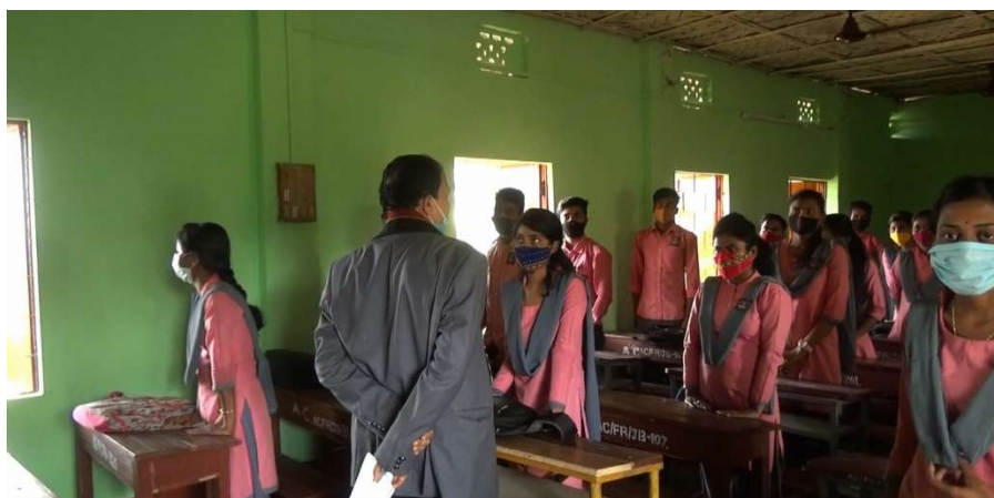
NAAC team interacting with students inside classroom on 26/02/2021