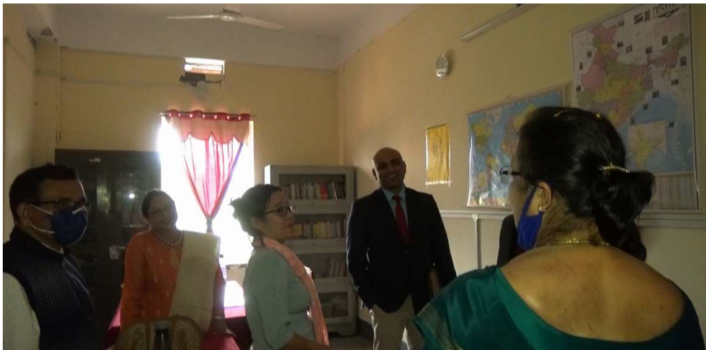
NAAC team interacting with faculty members inside the Dept. of History on 26/02/2021