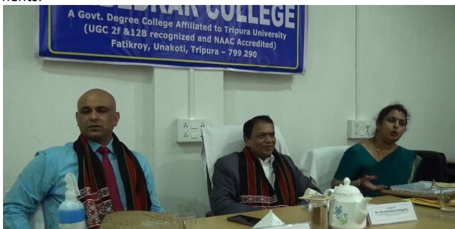
NAAC peer team interacting with HODs of different Departments on 26/02/2021

In the second session NAAC peer team had an interaction with heads of all departments of the college. All heads of different departments of Arts and Science streams gave presentation of their departments.