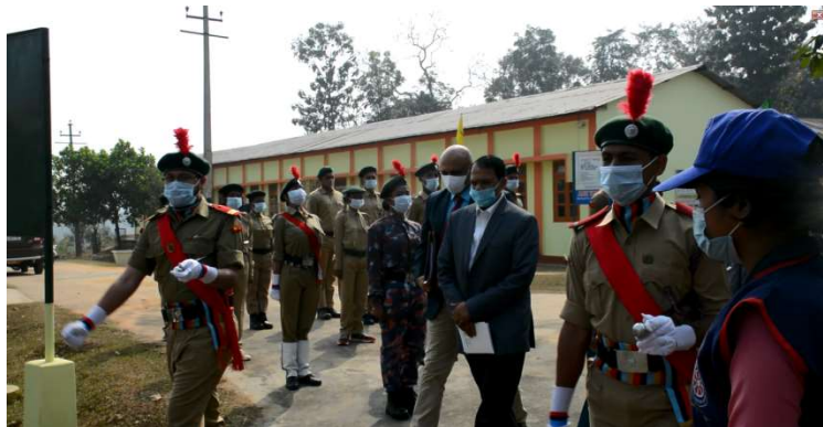
NCC cadets Receiving NAAC peer team on 26/02/2021