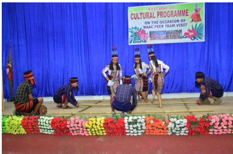
Students performing Bambo dance