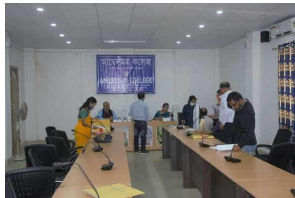
Celle Interaction with NCC officer