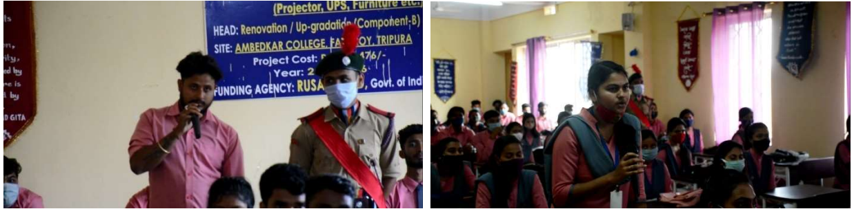
Students interacting with NAAC peer team members on 26/02/2021