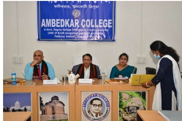
Interaction with Coordinator Anti-ragging Cell