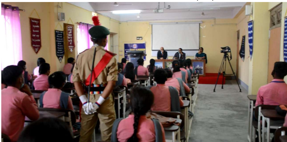
NAAC peer team interacting with students on 26/02/2021