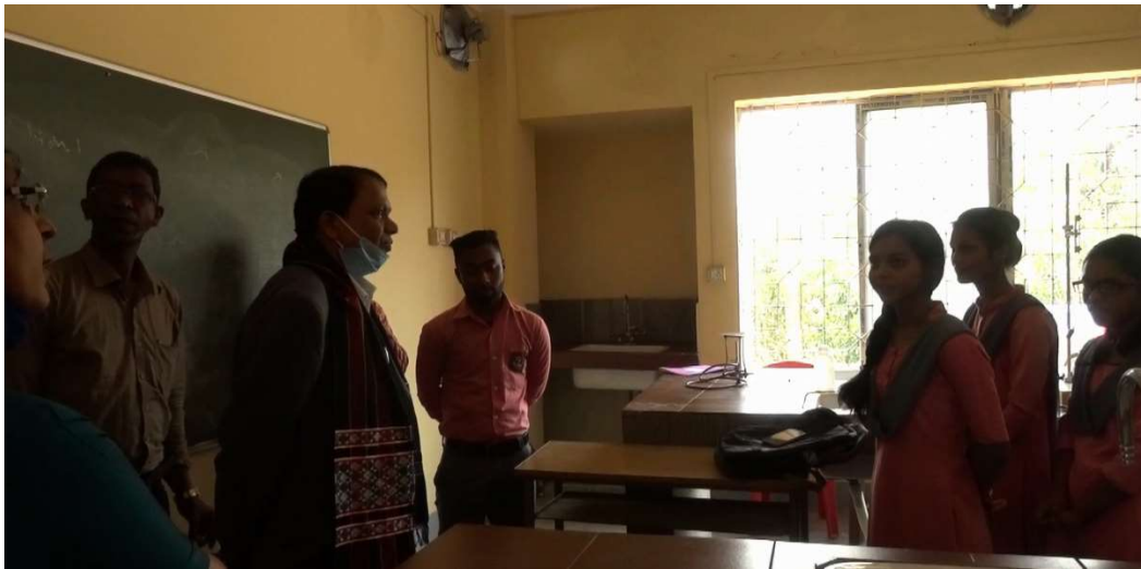
NAAC peer team inside Chemistry Lab interacting with students on on 26/02/2021