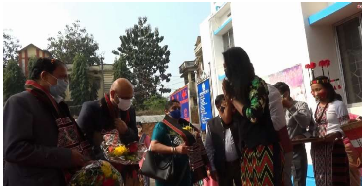
Faculty members offering welcome to NAAC peer team on 26/02/2021

The process of assessment begin with an in-depth interaction with the principal of the college after he presented the bird's eye view of its performance in the presence of NAAC coordinator and IQAC coordinators of the college.