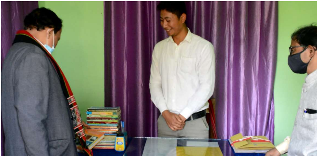
NAAC team interacting with faculty members inside the Dept. of Kokborak on 26/02/2021