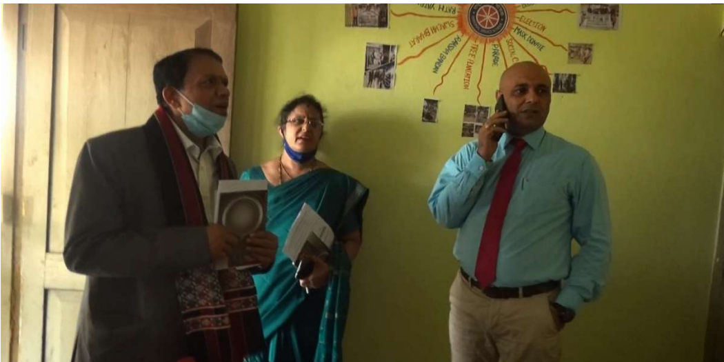
NAAC team visiting the NSS Cell on 26/02/2021